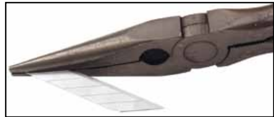
Blades easily break-away from strip using needle nose pliers.