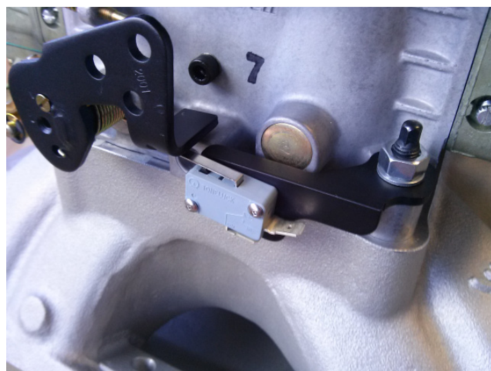
ALL54181 Shown Installed