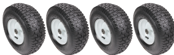
ALL10602 (Wheel Kit)

Allstar Performance 8300 Lane Dr., Watervliet, MI 49098 Phone: (269) 463-8000 Fax: (800) 772-2618 www.allstarperformance.com