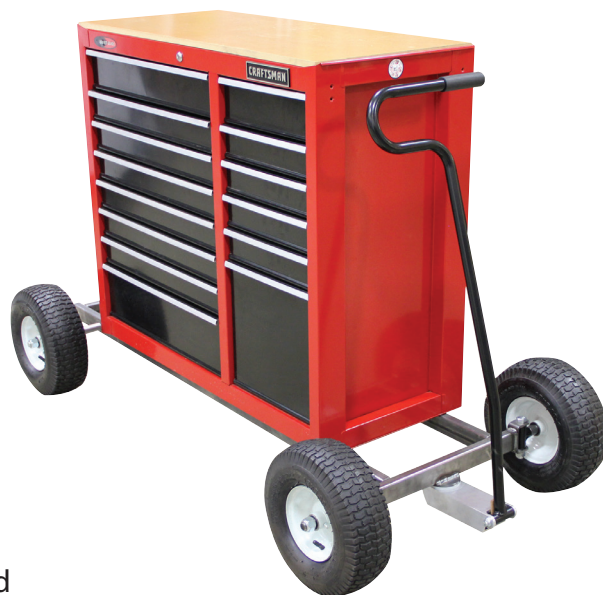
Tool Box Not Included

Cart has a pre-assembled front axle assembly with a pre-set width of 33", a maximum frame length of 60" and a 53" wheel base. Frame may be shortened as needed.