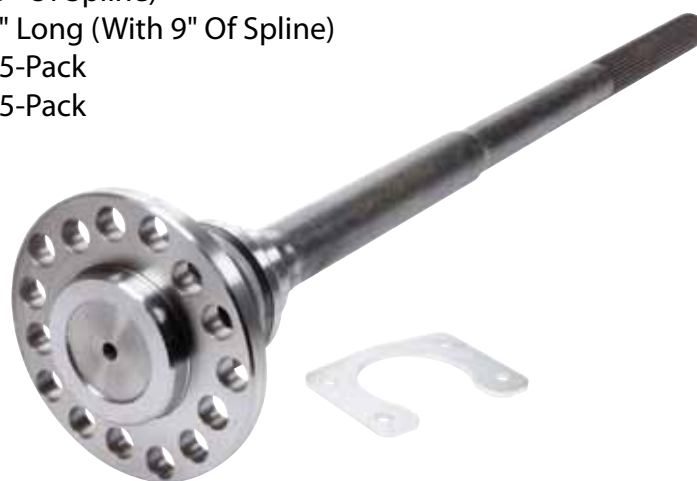
ALL72316 Large Bearing Late/Torino Style With 3/8" Hardware

Note: axle includes a spacer which allows axle to be a replacement for 2.36" or 2.50" offset axles. Spacer is pre-installed between axle flange and bearing assembly for 2.50" offset.