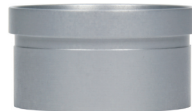
Inserts for 1" Restrictor Plate