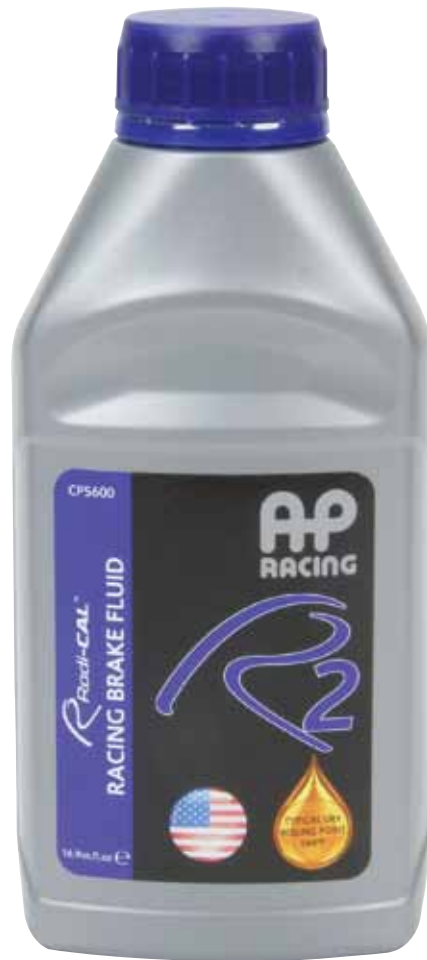
New rebranded bottle and label design

Designed for extreme, high temperature racing conditions with a dry boiling point of 594°F and a wet boiling point of 383°F. Conforms to DOT 4 specifications. Sold in 16.9 oz. bottle.