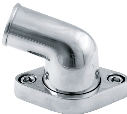
ALL30173 (75 Degree)