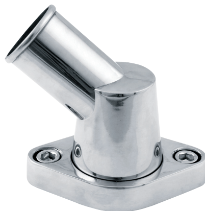
ALL30171 (45 Degree)