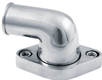
ALL30170 (90 Degree)