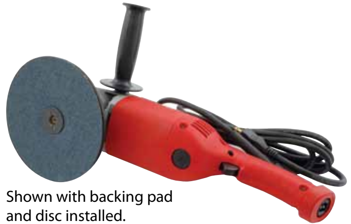
Shown with backing pad and disc installed.