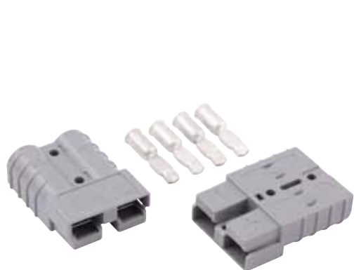
ALL76320 50-amp Gray 1pr.

Battery Quick Disconnects easily attach to any vehicle. Provides a connection for battery charging or quick battery changes during a race. Replace standard clamp ends on battery charger with disconnects to prevent accidental reverse polarity when hooking up charger. Disconnects have provisions for mounting so they can be easily secured to a vehicle. Choose from 50 or 175-amp ratings.