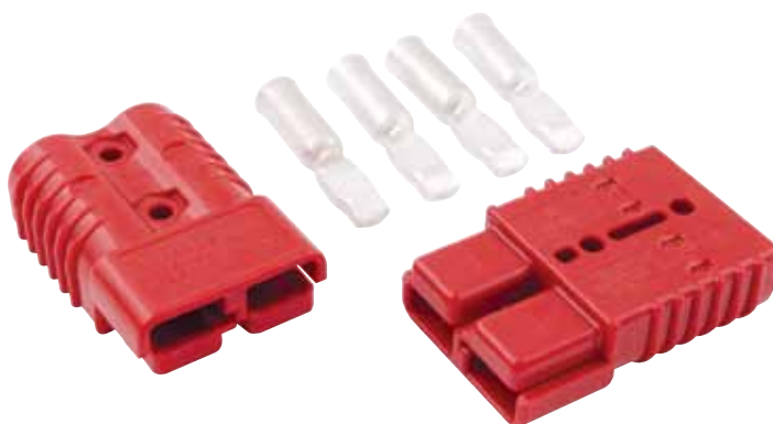
ALL76322 175-amp Red 1pr.