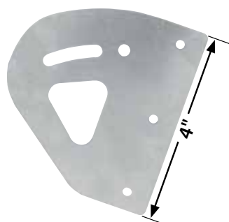
ALL23251 Bracket is pre-drilled as shown