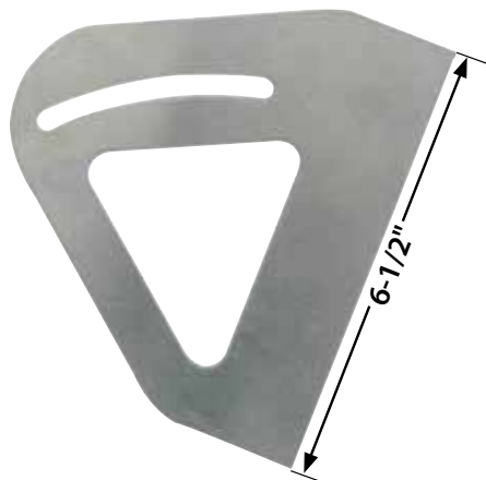
ALL23250 Bracket requires drilling of mounting holes