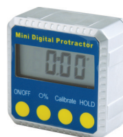
ALL10742 (Not included in kit)