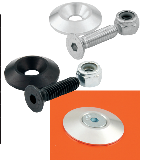
Kit Shown Installed On Sheet Aluminum