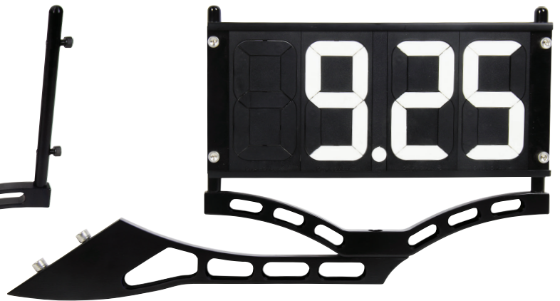
(Dial-In Board Sold Separately)