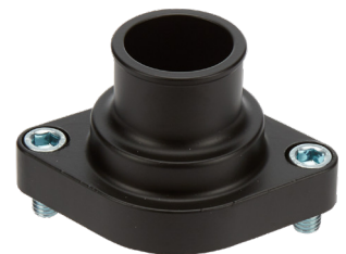
ALL30272 (Straight Neck)