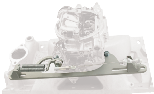
ALL54214 Shown On Edelbrock Carb