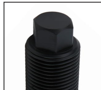
3/4" Hex Adjuster