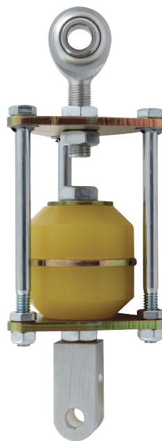
Shown with ALL58008 Rod End (Sold Separately)