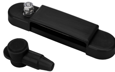
Shown with protective cover installed.