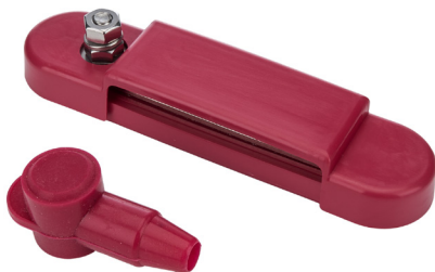
Shown with protective cover installed.