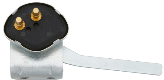
Circuit open, lights off

Allstar Performance 8300 Lane Dr., Watervliet, MI 49098 Phone: (269) 463-8000 Fax: (800) 772-2618 www.allstarperformance.com