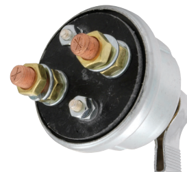
Standard Duty Double Pole

Double Pole Disconnect has four terminals with two separate circuits which is recommended for a vehicle with an alternator that needs to be shut down in the event of an emergency.