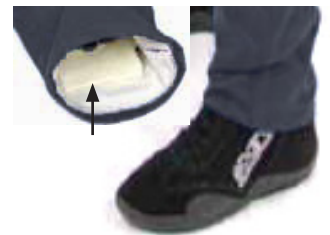
• Boot Cut (Hidden Cuffs)

Allstar Performance 8300 Lane Dr., Watervliet, MI 49098 Phone: (269) 463-8000 Fax: (800) 772-2618 www.allstarperformance.com