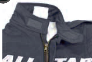
• Adjustable Collar • Neck To Waist Zipper