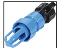
Drain Adapter w/ Valve